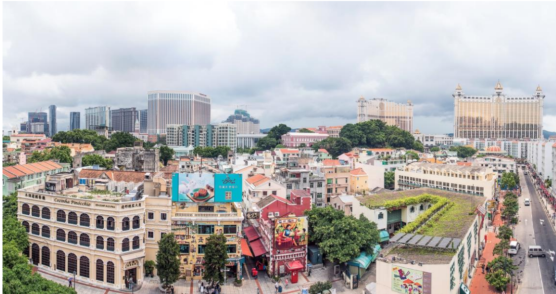
Panoramic View of Taipa Village

13 th October 2016 - Taipa Village Destination Limited continues to highlight a diverse range of attractions and dining establishments for an authentic Macau weekend getaway experience.